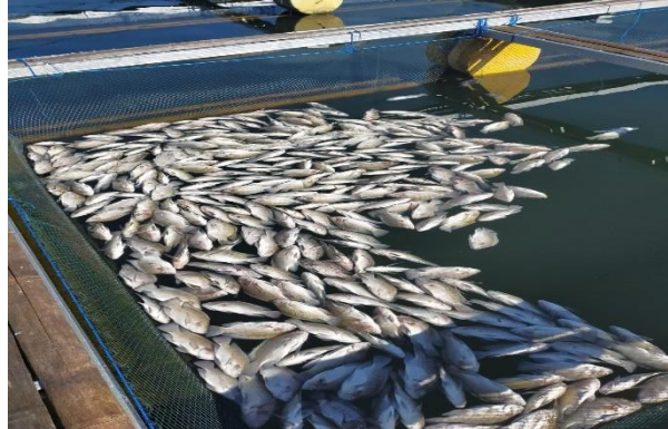
Figure 2. Mass fish mortality in floating net cages at Batur Lake, Bangli, Bali Province

accumulated at the bottom of the water to rise to the surface. The increase in residues on the water's surface causes the lake water to turn white. Likewise, ammonium tends to be toxic, and sulfur can follow dissolved oxygen in the water, so that cultured fish are poisoned to hypoxia. Fish that experience poisoning and hypoxia generally show symptoms such as looking weak and swimming on the water's surface until the color of the fish changes to a paler color (Figure 2).