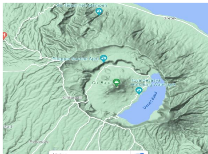
Figure 1. Location of the research

The data was obtained through field-scale research to the location of the outbreak, carrying out discussions with the Fisheries and Marine Service officers, Bangli Regency, and local fish farmers. Fish was also documented from several areas around Batur Lake (Figure 1).