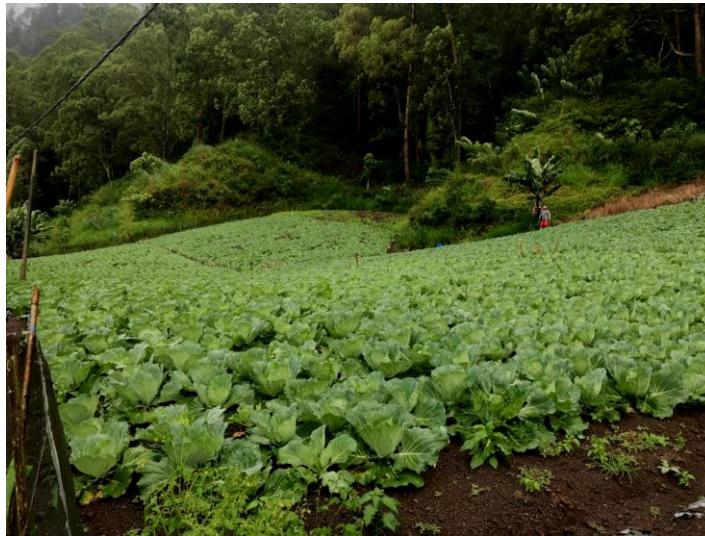
Figure 3. Vegetables cultivated around Batur Lake, Bangli, Bali Province

Heavy metal is critical because, apart from being one of the causes of fish deaths, in this case, heavy metals are highly toxic through different food sources such as fish, vegetables, and fruits that farmers around the lake cultivate. Serious metal pollutions could be accumulated in cultured fish and other aquatic biotas. In agricultural land, it causes bioaccumulation in horticultural crops. Several diseases in humans by bioaccumulation of heavy metals had Minamata and Itai-Itai diseases in Japan after consuming fish and rice contaminated with Hg and Cd [18,19].